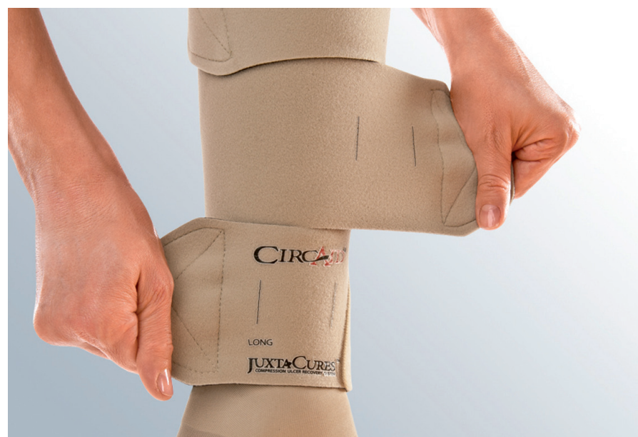
Figure 1. The Juxta CURES compression system.

Leg ulcers can have a significant effect on patients' quality of life, with