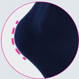
Pre-formed heel for easy positioning and improved fit.