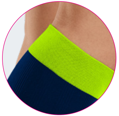
Broad knee stocking band for additional hold.

Additionally: Comfortable compression from the midfoot area