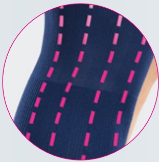
3D lengthwise ribbing facilitates correct placement and provides secure handling.