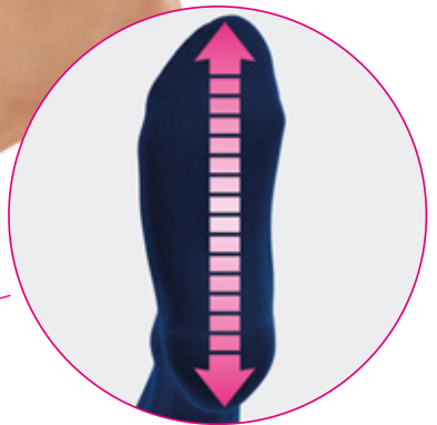
Forefoot is sized individually to provide improved fit.