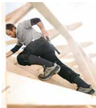
5 mediven active®