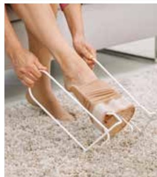
11 m2m Application aids