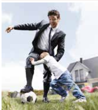
5 mediven® for men