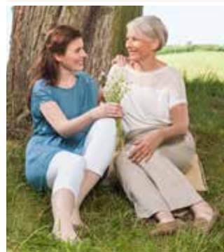
10 mediven® harmony