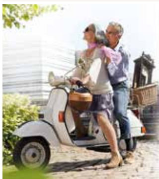
6 mediven plus®