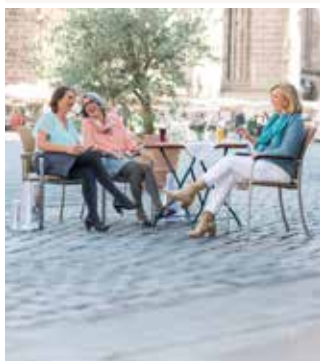
8 UCS® Debridement juxtacures, juxtalite juxtafit