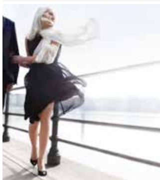
4 mediven elegance®