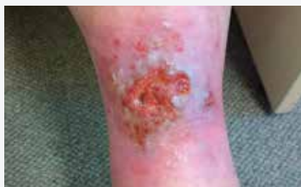
Figure 2. The wound on day 14