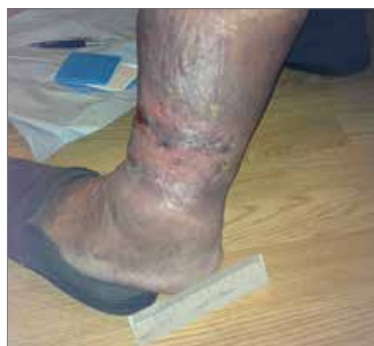
Figure 8. The wound at week 9

juxtacures, and his wound and application of the garment were assessed at weekly visits, which were scheduled at the end of the week to fit in with his work commitments. The patient commented that he found juxtacures comfortable and easy to use, although he was unable to tolerate the (standard sized) ankle as it was too tight for his size 12 feet (a larger size has since been released). This did not result in oedema. He stated that the garment gave him more freedom of movement, especially in the foot, than did the previous compression systems.