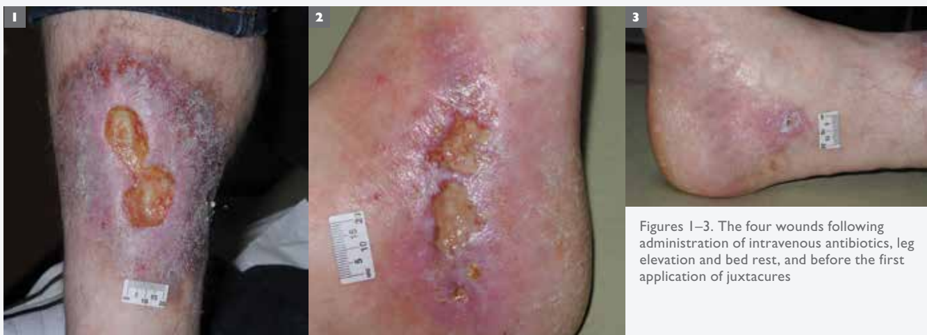
Figures 1–3. The four wounds following administration of intravenous antibiotics, leg elevation and bed rest, and before the first application of juxtacures

The largest ulcer, which was located on the shin, measured approximately 10 x 7 x 2.5 cm and was completely filled with slough (Fig 1). In addition, there were two