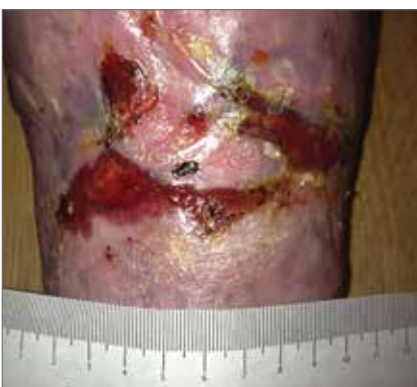
Figure 7. Anterior aspect at week 8