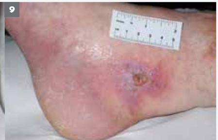
Figures 7–9. The same wounds after 10 weeks of treatment with juxtacures

areas of sloughy ulceration on the lateral aspect of the foot, each measuring approximately 5 x 4 cm (Fig 2). The new ulcer, which was the most painful, was on the medial aspect of the ankle and measured approximately 2 x 2 cm (Fig 3). All ulcers were producing heavy volumes of exudate, so the surrounding skin was extremely fragile and painful, and at risk of breakdown.