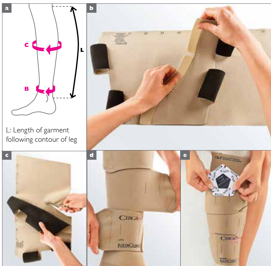
Figure 2. How to apply juxtacures. a) Select the correct length: short, standard or long. b) After measuring the ankle and calf circumferences, juxtacures is assembled for a perfect fit. c) The excess material is cut away. d) The device is fitted to the lower leg. e) The pressure applied is checked with the built-in pressure system (BPS) card and adjusted as required

The final application of the system creates a less elastic effect, in that the build-up of the layers and the cohesive nature of the fourth layer restrict the movement of the bandages, allowing it to have a high static stiffness. 16