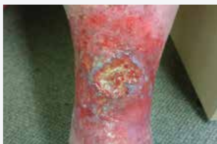
Figure 1. The wound on day 0

'When I first opened the packaging it appeared very complicated; once I had separated out the components and read the instructions, it was a lot clearer and I found it very easy to apply'