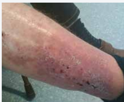
Figure 2. The wound on day 28