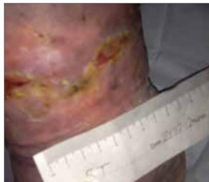
Figure 6. Lateral aspect at week 5