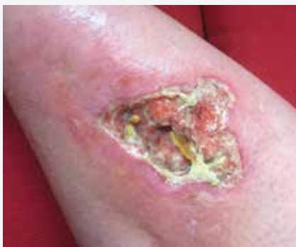
Figure 3. The ulcer after 4 weeks of treatment with juxtacures