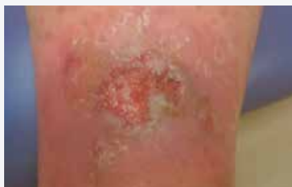
Figure 3. The wound on day 28