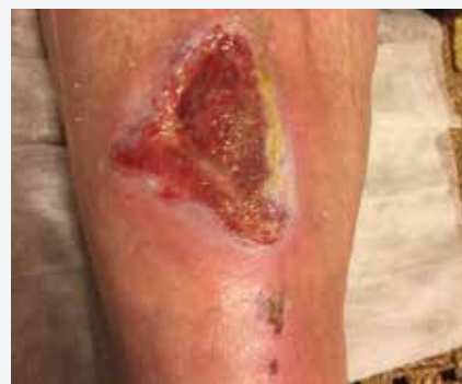
Figure 2. The same ulcer after 3 weeks of treatment with juxtacures