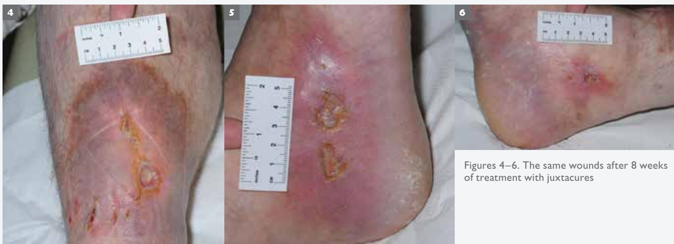
Figures 4–6. The same wounds after 8 weeks of treatment with juxtacures