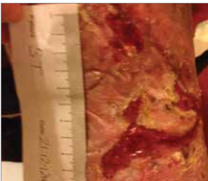
Figure 5. Anterior aspect at week 5