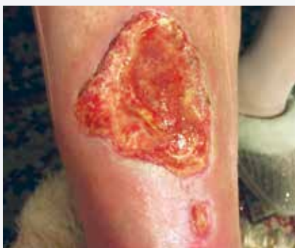
Figure 1. The venous leg ulcer after one week of larval therapy

The patient stopped taking Oramorph after 3 weeks of treatment (Fig 2). At week 4 the wound had reduced in size by 50% and there was clear evidence of granulation tissue formation (Fig 3). At week 6, the wound measured 2x2x4 cm, and the patient was now able to reduce her medication to codeine only (Fig 4). At week 8, the ulcer had healed and the patient was discharged from the NP's care with a long-term prescription for compression stockings and a date for a re-assessment at 3 months. The patient has since returned to work and her mood remains positive and happy.