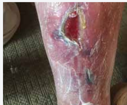
Figure 4. The ulcer after 6 weeks of treatment with juxtacures