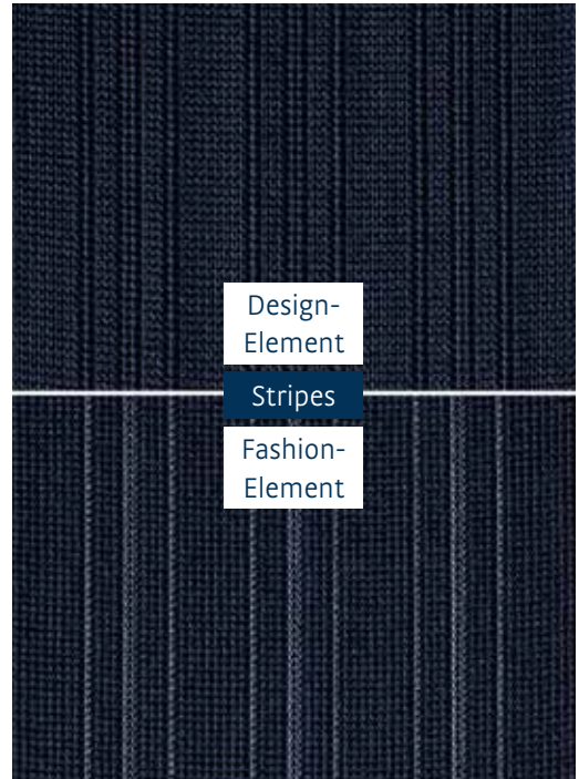
Image shows Design-Element (one colour) and Fashion-Element (2 shades of one colour)