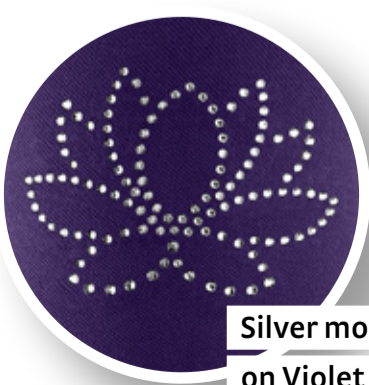
Silver motif 'Waterlily' on Violet